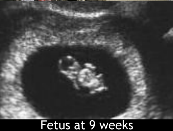
Fetus at 9 weeks