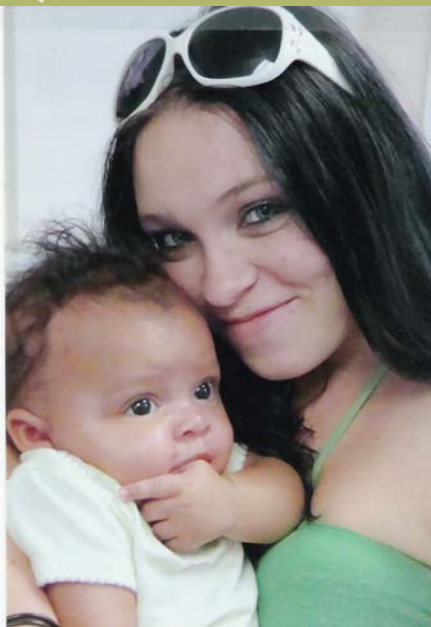
Photo and story used with permission Name changed to protect her privacy